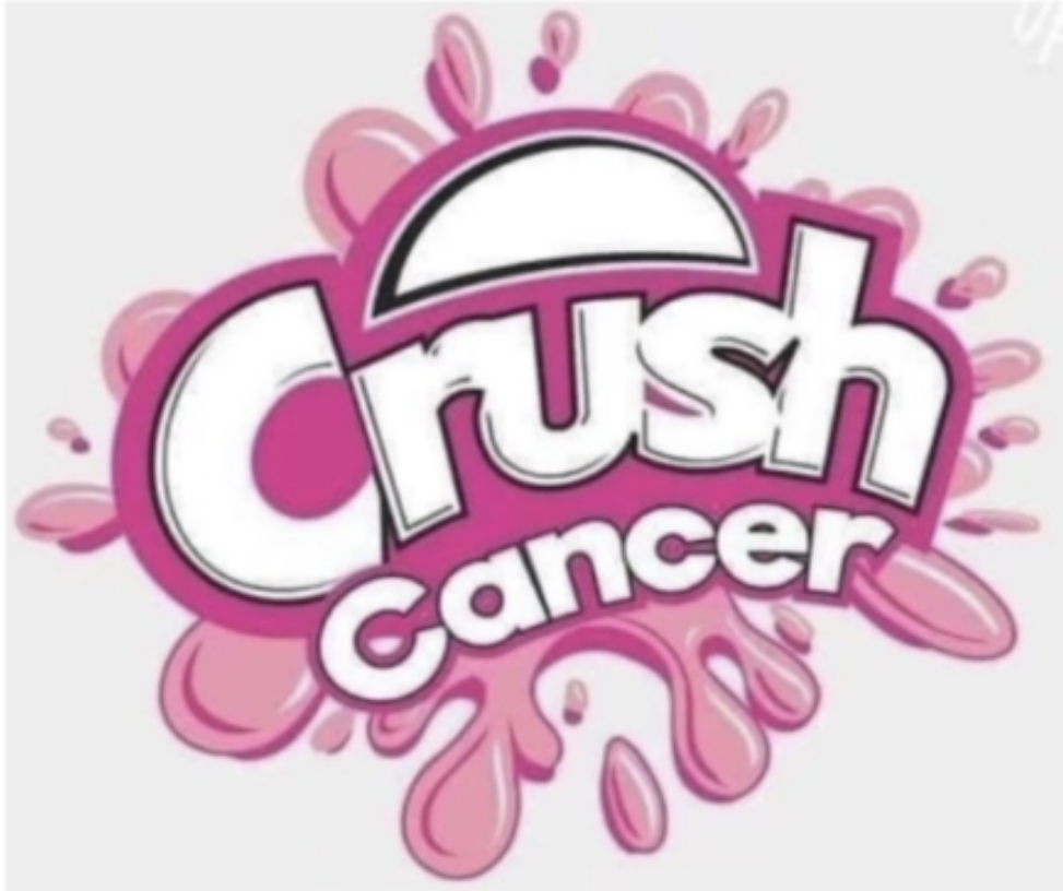
Image that will be featured on all of the shirts

ALL PROCEEDS FOR THE ACTIVITIES WILL BE DONATED TO SUSAN G KOMEN